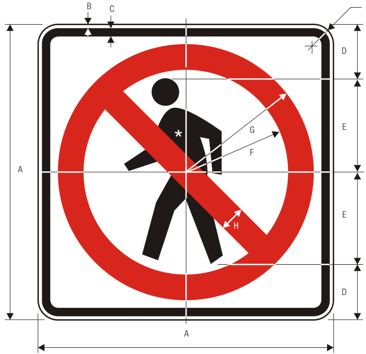
R9-3a NO PEDESTRIAN CROSSING

COLORS: CIRCLE & DIAGONAL — RED (RETROREFLECTIVE) *See page 6-10 for symbol design SYMBOL — BLACK BACKGROUND — WHITE (RETROREFLECTIVE)