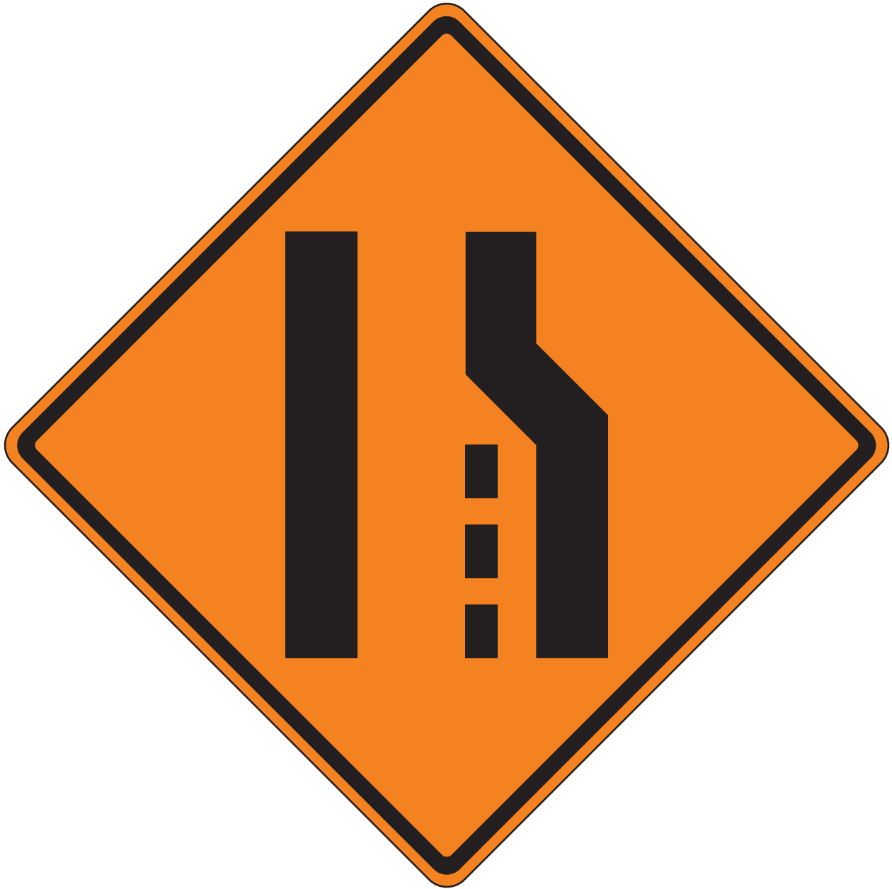
W4-2R Lane Ends (symbol) (right)