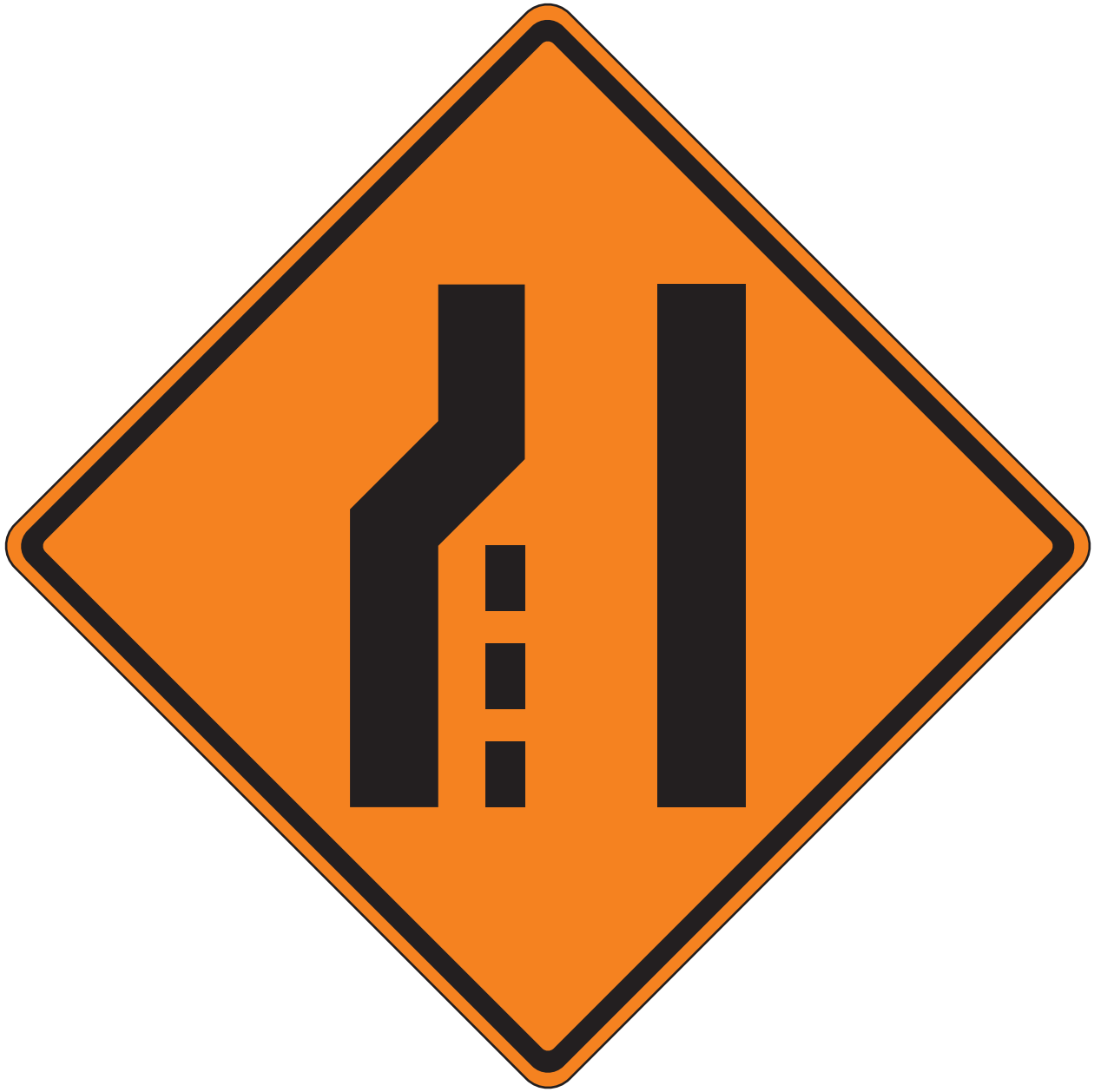
W4-2L Lane Ends (symbol) (left)