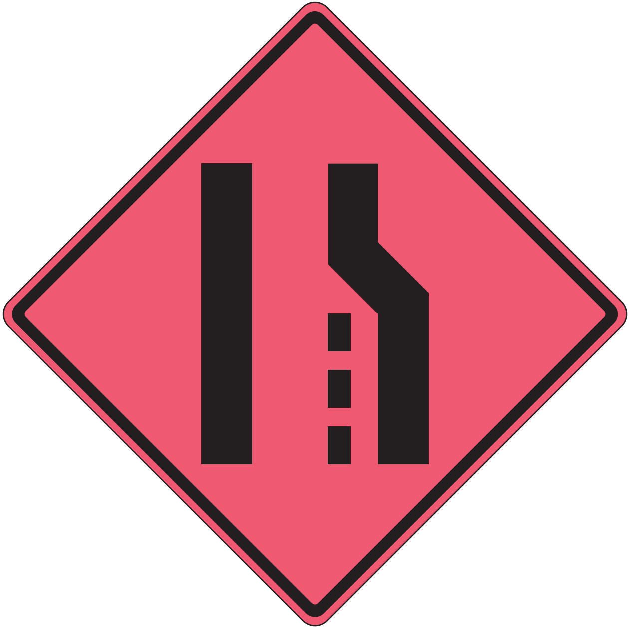
W4-2R Lane Ends (symbol) (right)

Sign image from the Manual of Traffic Signs < http://www.trafficsign.us/ >