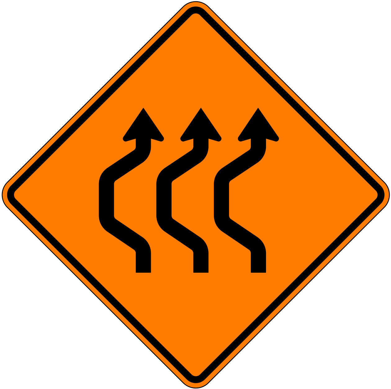
W24-1bL Double Reverse Left Curve (3 lanes)

Sign image from the Manual of Traffic Signs < http://www.trafficsign.us/ > This sign image copyright Richard C. Moeur. All rights reserved.