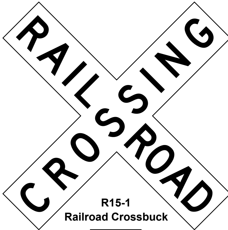
R15-1 Railroad Crossbuck